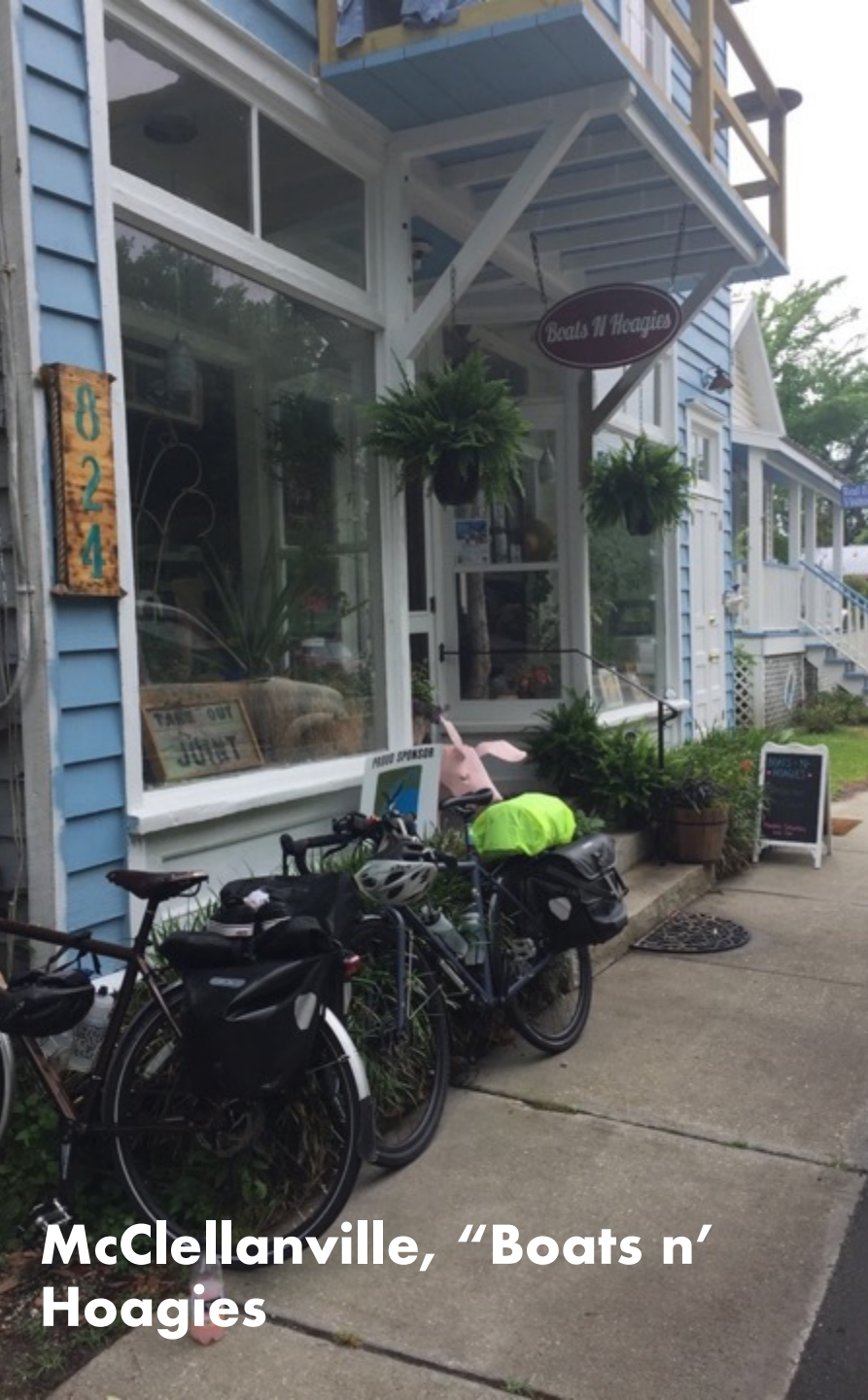
McClellanville, "Boats n' Hoagies